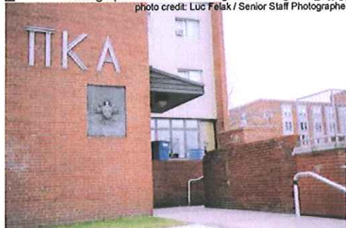
Carnegie Mellon University's Pi Kappa Alpha fraternity

much, he said, adding that the death was ruled an accident.